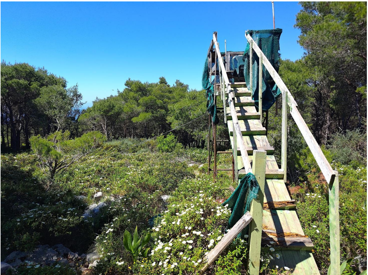
Photo on the cover: hunting hide in the “hunting village” in Keri