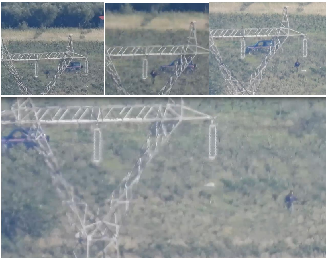
Pic. 1-4: Wardens' car approaches the hunter and they yell at him. While he is running away, the patrol car keeps driving in another direction and joins CABS team, who is waiting to report this hunter.

On the 19 th of April, in the afternoon, while a CABS team was waiting for the wardens at the agreed meeting point, after communicating the presence of a hunter nearby, CABS spotter managed to film the wardens approaching the hunter by car, waving him to immediately leave and then reaching the meeting point. Then they pretended in front of CABS team not to have been in the area before, clearly betraying their intention to boycott the prosecution. CABS has officially reported the offence and the wardens to the Greek Police and the Prosecutor of Zakynthos, based on the evidence collected.