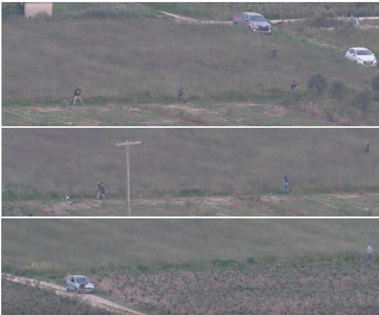
Pic. 5-7: 3 CABS volunteers (right) are approaching the hunter with dog (left), while the wardens' car is still on the road (although they drove together). CABS volunteer joins the hunter and asks him to stop and wait for the wardens. The hunter has the time to store the gun, get the dog in the car and start driving, while CABS volunteer tries to stop him. Only in the last frame the warden (on the right with white jumper) shows up in the field.

On the 18 th of April, in the afternoon, CABS spotted a hunter and drove with the wardens in the area. They correctly approached by foot the hunter and caught him red-handed after he had just fired two shots to Turtle Doves (he tried to outrun the wardens but was stopped by CABS members). At this point the warden intervened not to prosecute him, but to defend him – to everyone’s surprise - by discharging the shotgun in front of everybody and claiming he was not seen hunting and that he was only training the dog. The warden and the hunter together begged CABS members (!!!) NOT to proceed with the prosecution.