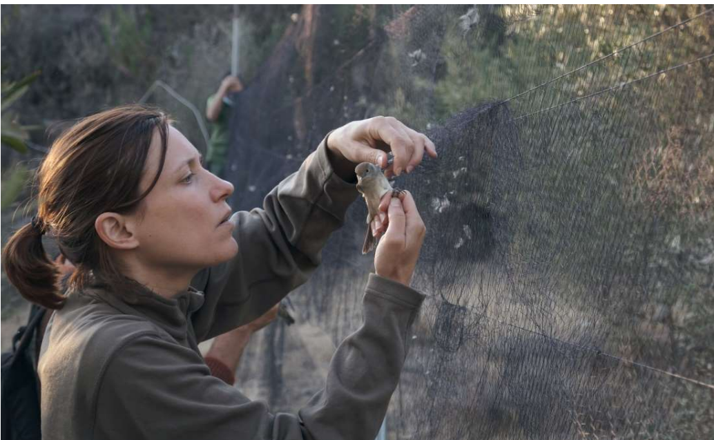
Picture 1: CABS activist rescuing bird from a net found in Kalavassos, October 2021

Each autumn since 2009, CABS & SPA organise bird protection camps in Cyprus to prevent and disrupt the largescale indiscriminate slaughter of migratory birds passing over Cyprus. This autumn, the camp started on the 6th of September and ended on the 14th of November, running for a total of 70 days and covering most of the autumn poaching season. 14 bird protection activists from 7 different countries (Germany, Great Britain, Italy, Switzerland, Slovenia, Spain and United States of America) participated at the camp. 10 volunteers already participated in previous camps within Cyprus, while 4 of them were first timers. The volunteers monitored the eastern and the southern part of Cyprus: Famagusta and Larnaca District within the Republic of Cyprus, the British Eastern Sovereign Base Areas and part of the self-proclaimed Turkish Republic of Northern Cyprus.