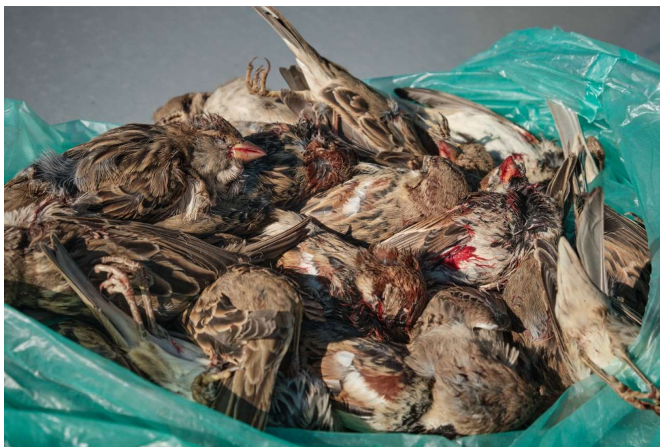
Picture 2: Bag with 24 shot Spanish sparrow was found in possession of a hunter reported by CABS activists in October 2021

In the Republic of Cyprus, the Game and Fauna Service is the only statutory institution specifically delegated to deal with the problem of bird poaching since 2019, when the Anti-Poaching Unit of the police was dismantled. For this reason, CABS report the cases of wildlife crimes to game wardens whenever possible.