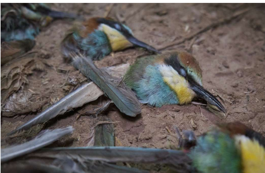
Picture 4: Heads of Bee-eaters, found at the hunting site near Lake Soros, September 2021

As shown in Section 8 of this report, CABS volunteers have now clearly become the main stakeholder in the field against illegal bird killing activities and this unpleasant role has made CABS the main target for criminal individuals and gangs. In 2021, our teams suffered the highest level of intimidation and violence with two dangerous and serious aggressions – even a pyrotechnic bomb placed on our car - happening in autumn and winter. Although the relevant Ministries have been always and immediately informed of these events, we have never received a reply from anyone. Instead, we see that the Parliament is discussing a law proposal which should punish people who “disturb” legal hunting activity. Since there are no such people in Cyprus, it is clear that the aim is to prevent CABS from exposing and pushing to sanction the illegal killing of birds that take place in the Republic of Cyprus.