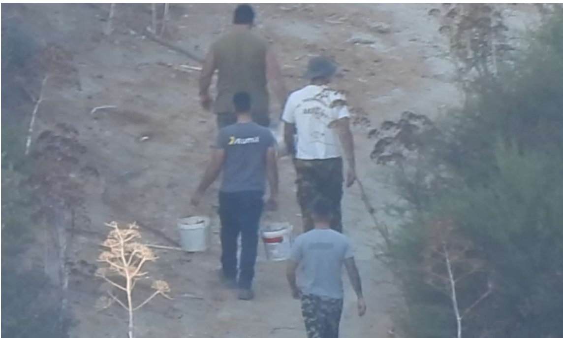
Picture 3: Trappers with buckets full of killed birds, collected from nets at the trapping site of Akas, September 2021