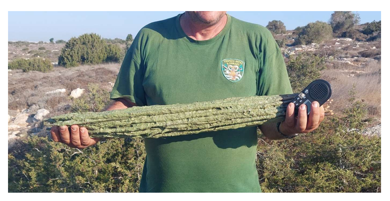
Picture 2: GFS officer with limesticks and caller seized from trapping site found active during the camp.

In almost 20% of the cases reported (14 out of 73) the patrol was not available. All the cases referred happened in the Larnaca and Famagusta districts, the trapping/hunting blackspot of the island.