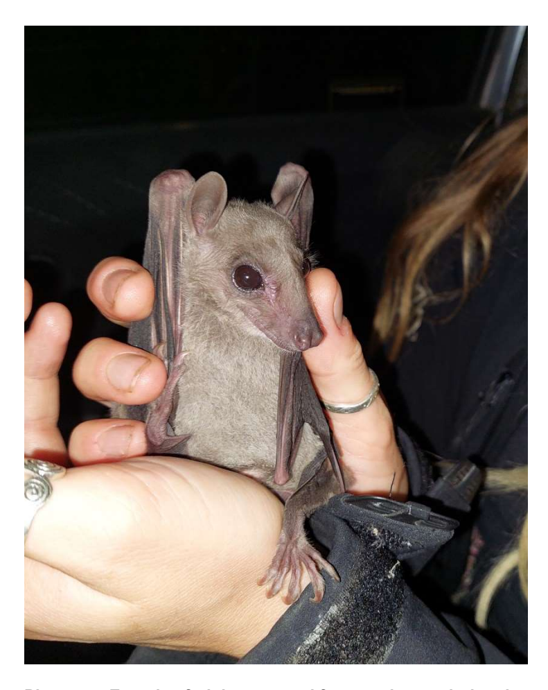
Picture 4: Egyptian fruit bat rescued from a mist net during the camp

Once again, we would like to list our recommendations to the authorities in Cyprus: