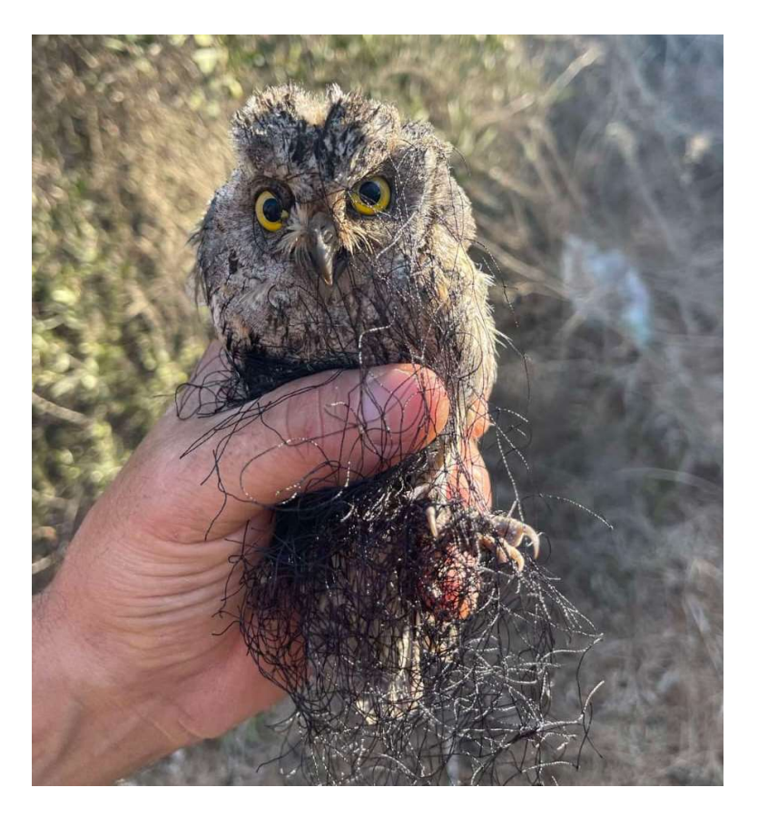
Picture 3: Scops owl rescued from a net found in the ESBA.