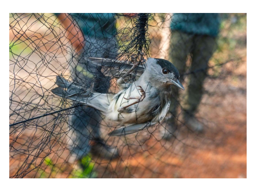
Picture 1: Blackcap saved from a net during CABS & SPA Autumn BPC 2022.