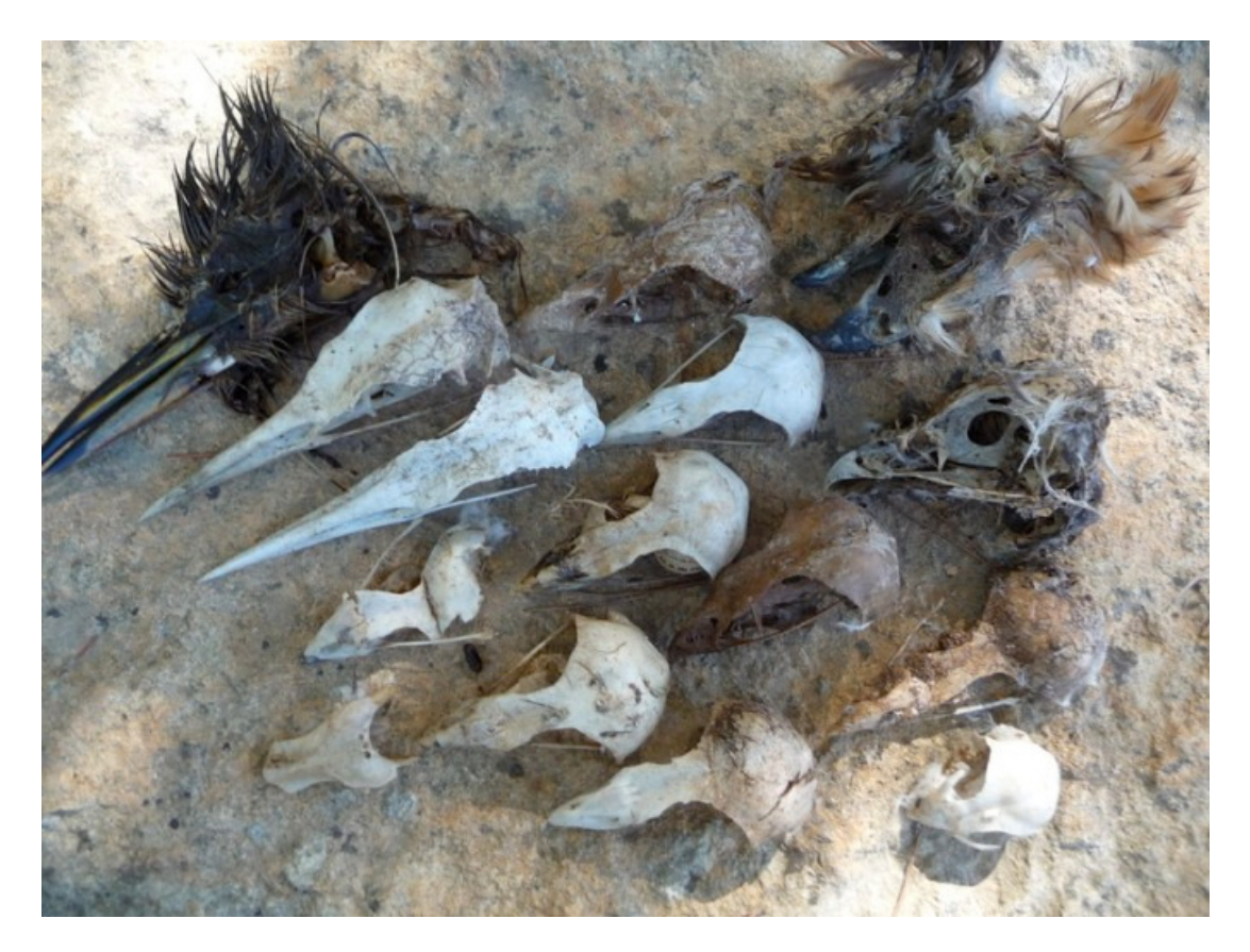
Image 11. A selection of skulls found in Mizieb, including herons and raptors.