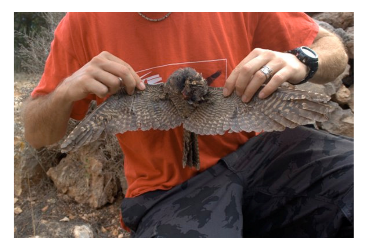
Image 9. Freshly killed European Nightjar, found stuffed into the rocks of a hunting hide on the 21<sup>st</sup> September.