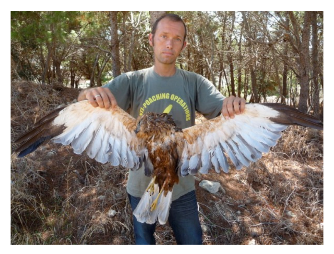
Image 7. A member of CABS displaying a freshly killed adult Marsh Harrier.