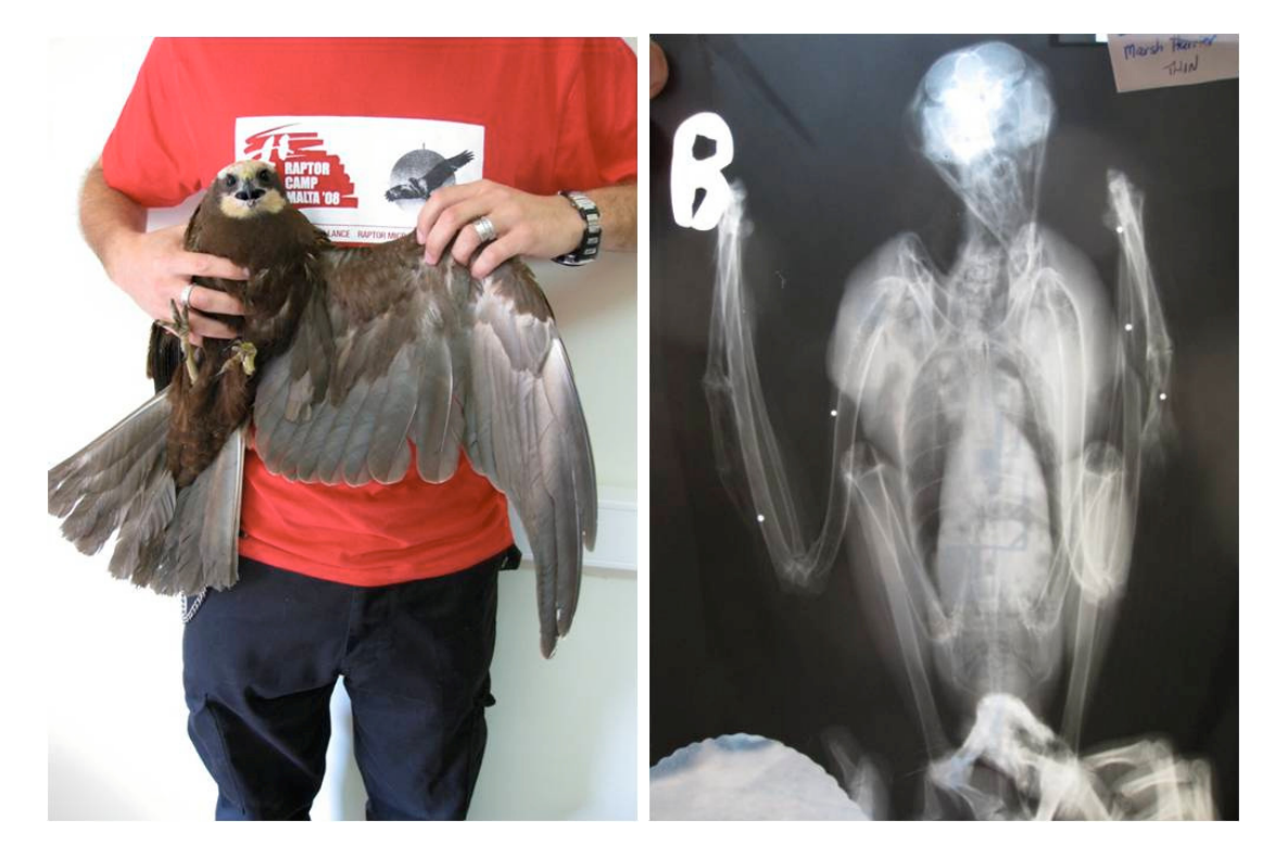
Image 19. Shot Marsh Harrier (and X-ray) recovered from Mizieb, 28<sup>th</sup> September 2008.