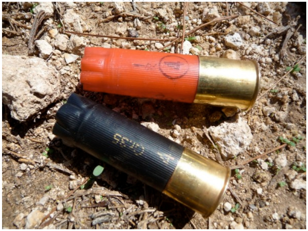
Image 5. Freshly used cartridges of a large gauge found near the freshly killed Marsh Harriers on the 20<sup>th</sup> September 2009.