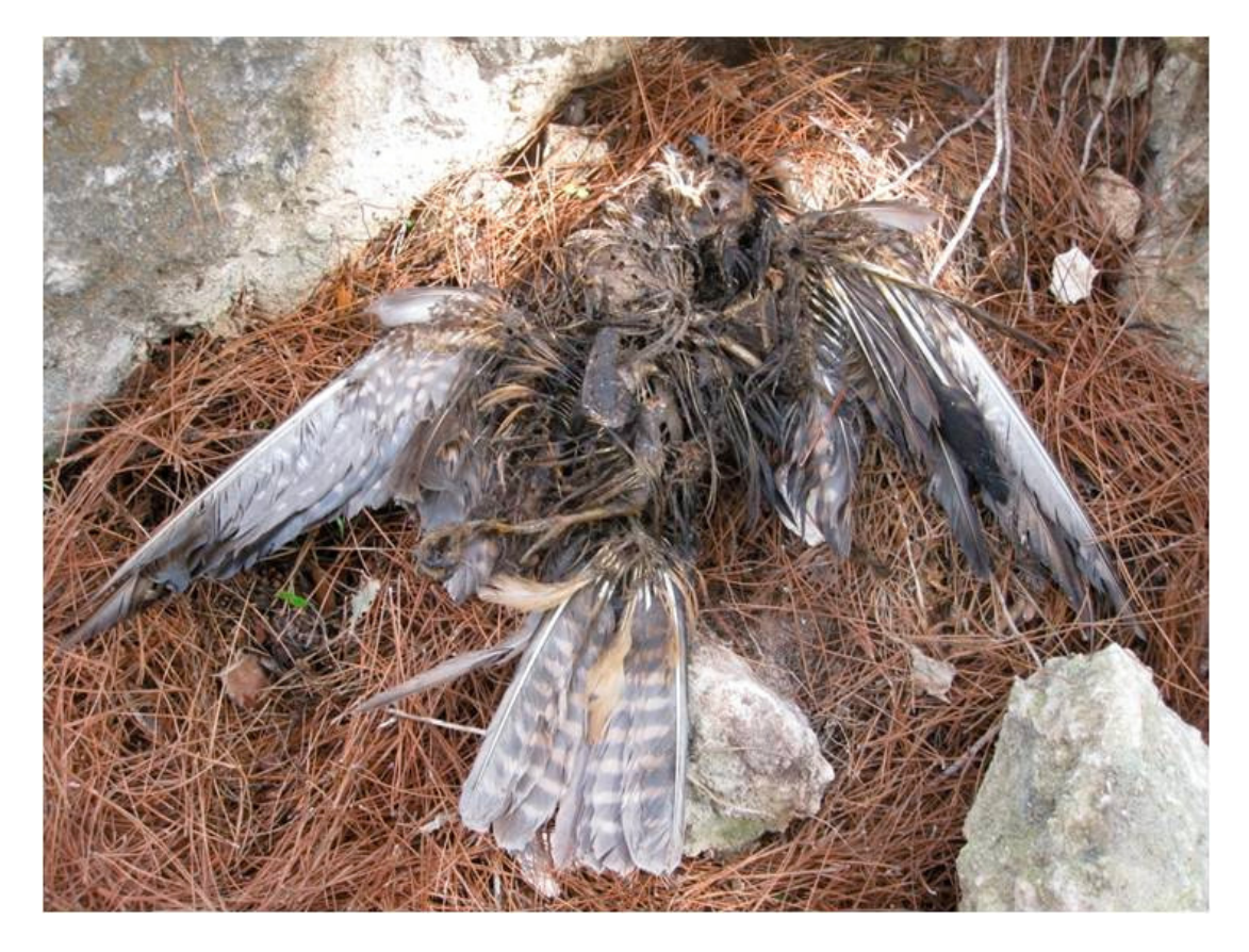
Image 13. Body of a juvenile European Hobby found hidden under a pile of rocks in Mizieb.