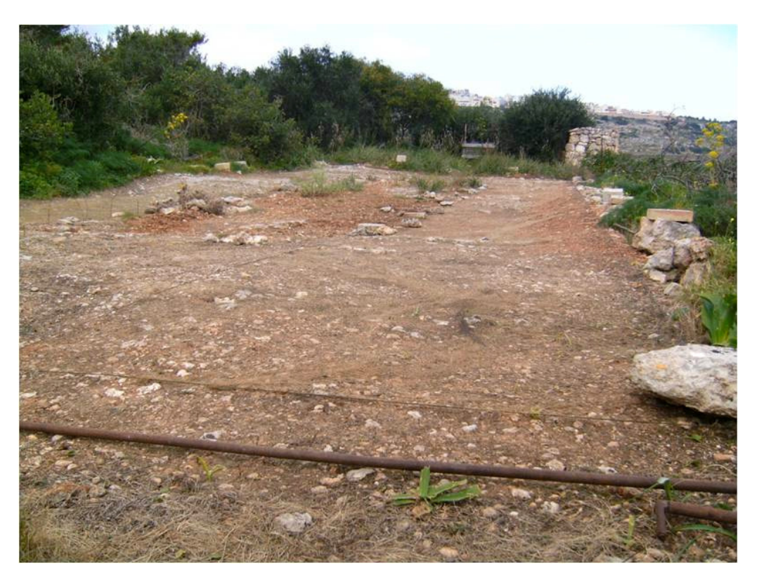
Image 17. Clap nets being illegally used by a trapper in Mizieb during the closed season in spring 2008 – the trapper escaped but the ALE confiscated the nets.

Image 16. Finch trapper actively trapping in autumn 2008 in a hide built within the area designated as a Bird Sanctuary.