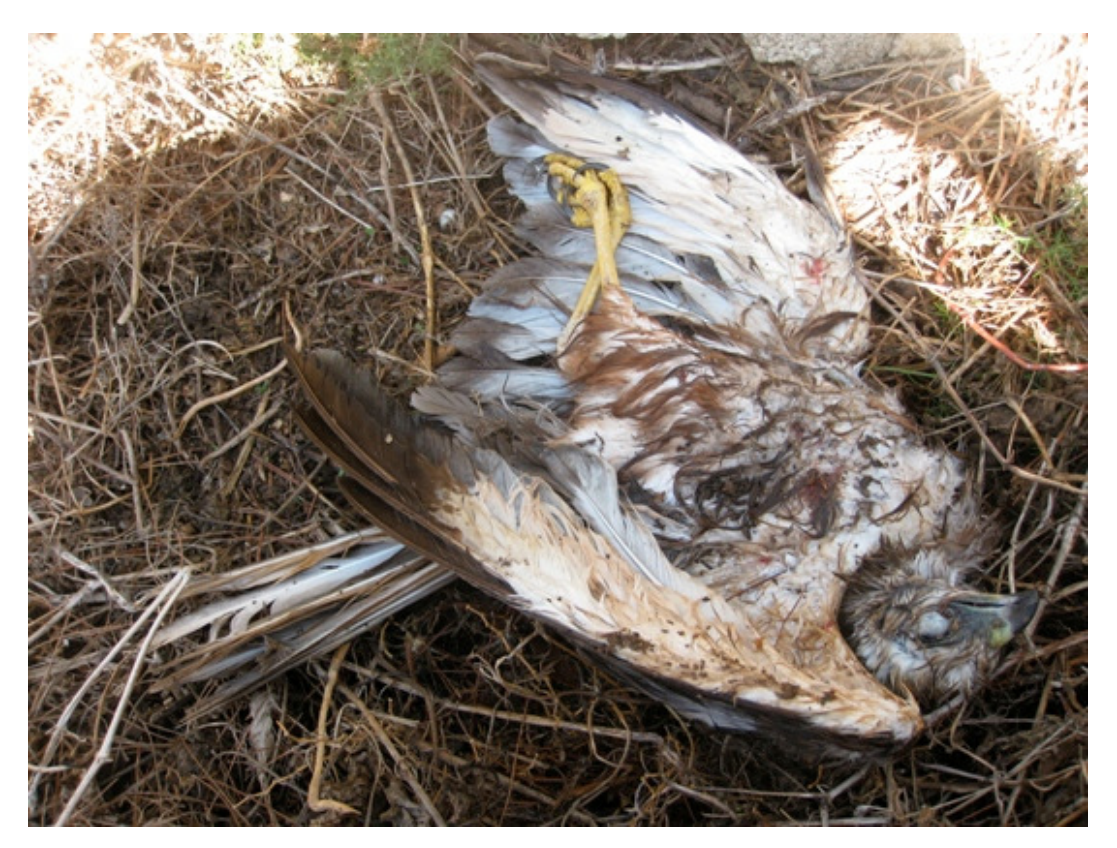
Image 6. A freshly killed adult male Marsh Harrier found hidden under a stone.