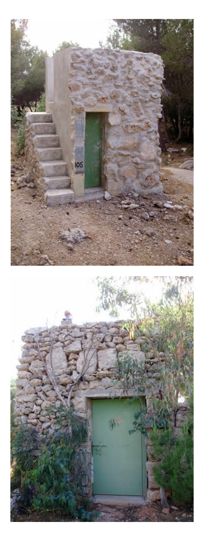
Images 1 & 2. Some of the illegally built hunting hides in Mizieb consist of two story concrete structures.

Annex A. Images of a selection of hunting and trapping hides in Mizieb