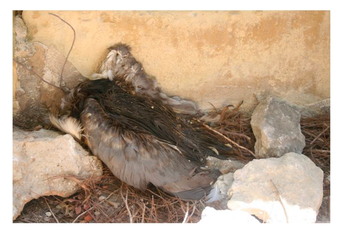
Image 12. The body of an adult Night Heron, killed within the last few weeks.

Image 11. A selection of skulls found in Mizieb, including herons and raptors.