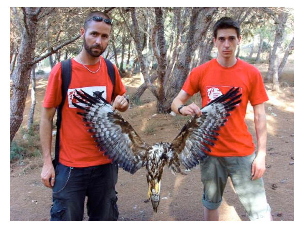
Image 8. Members of BirdLife Malta displaying a freshly shot Honey Buzzard.