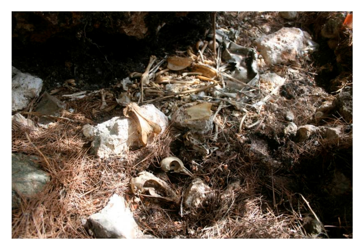
Image 14. The remains of several raptors and passerines found stashed in a crevice