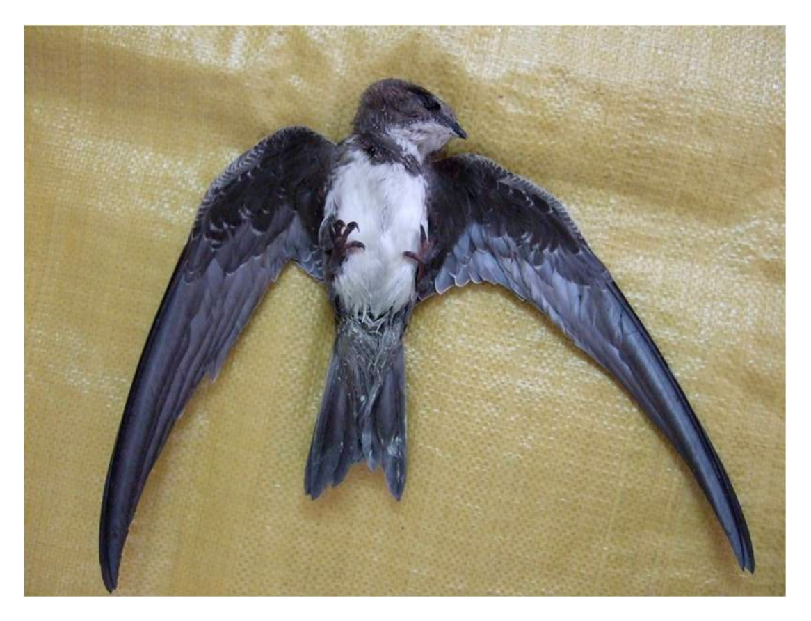
Image 18. Dead Alpine Swift Apus melba found in Mizieb, 29<sup>th</sup> October 2007.