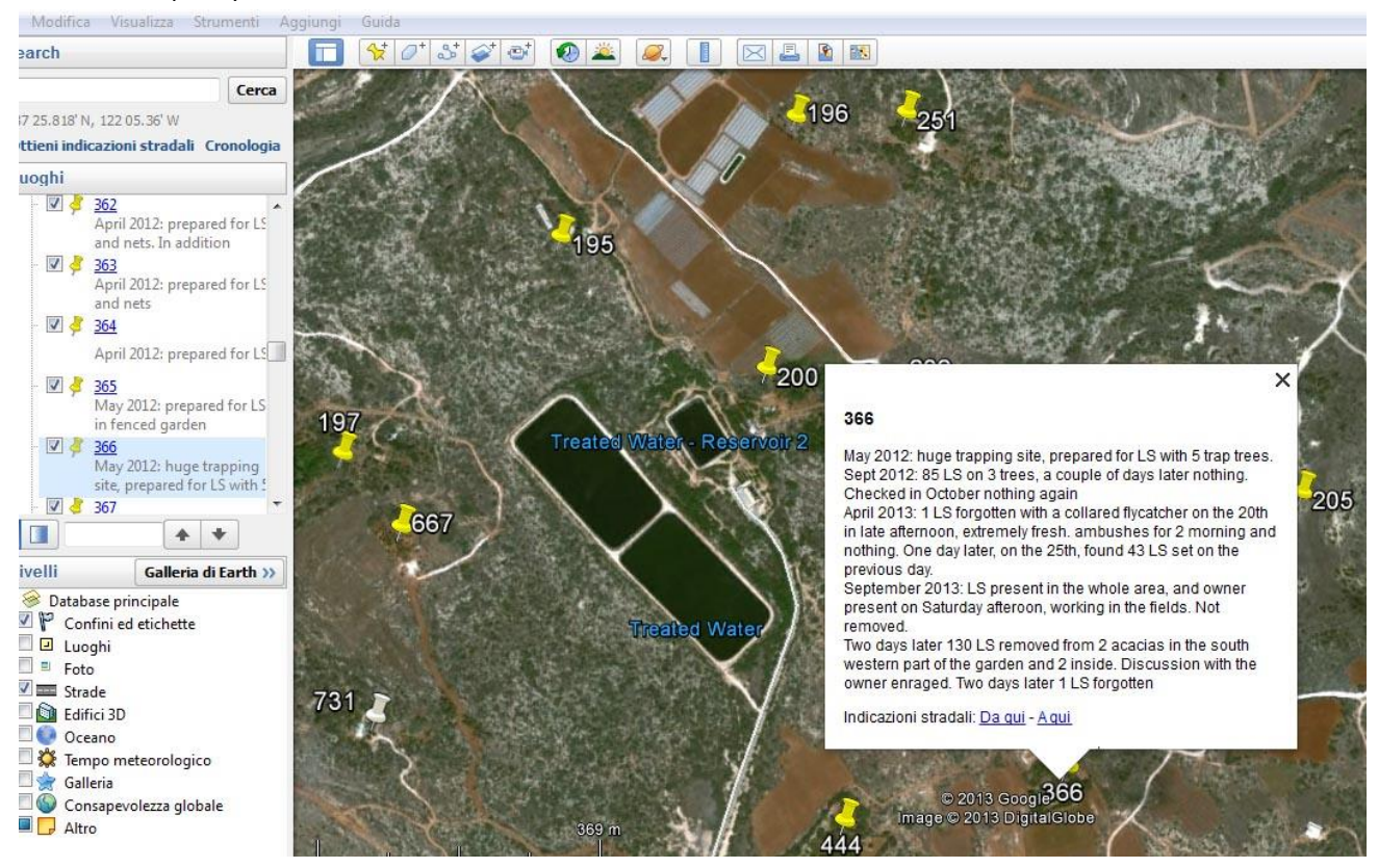
Figure 1: CABS trapping sites data base. Each trapping site has a record of any check, numbers of traps found, notes, etc. 768 trapping sites has been recorded and monitored so far

This new policy has been communicated to trappers. The "Group for Reclamation of the Traditional Hunting with Limesticks", formerly called "Friends of limesticks", is indeed an unofficial pressure group linked with Parliamentarians and local authorities, which gathers together trappers from the south-east of Famagusta district. BPCs and the cooperation with authorities had achieved the goal of deterring trappers, progressively lowering the numbers of the traps set out. However, the "new wave of tolerance" has reversed this trend. The attitude of trappers was of people with more impunity.