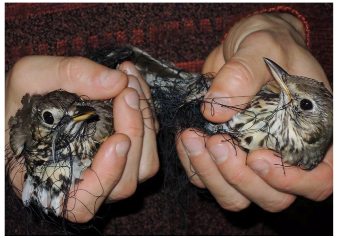
Figure 6: Thrushes released from mist nets by CABS volunteers

The next day, on the 8<sup>th</sup> of October 2013, 5 days before the end of the camp, CABS received an official communication