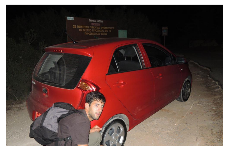
Figure 3: CABS volunteer checks the slashed tires of the rental car in front of the Capo Greco national park sign

more as an input, a stimulus and a technical support that civil society can provide to the competent law enforcement agencies, in order to help them perform their duties, which are prescribed in the law, but not yet implemented for social, cultural, economic and / or political reasons. If the responsible authorities supported this process, as they did from autumn 2011 to spring 2013 in Cyprus, severe wildlife crime could progressively tackled without any backlash from the poachers' lobby and any incidents of abuse and violence from the trappers in the field. Nevertheless, the new Government of the Republic of Cyprus has decided to boycott this process and has worked to marginalize and even criminalize the most active,