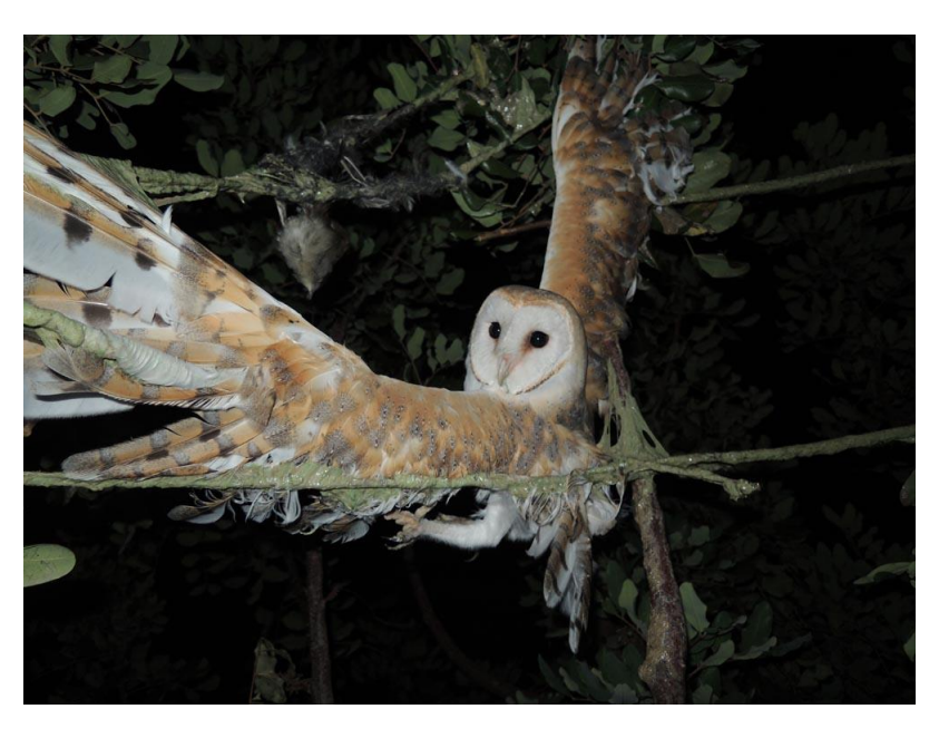
Figure 5: Barn Owl caught in limesticks in a trapping site near Kalavasos

On the 24 <sup>th</sup> of September 2013 , a Member of the Committee on Environment, Public Health and Food Safety of the European Parliament sent a letter to the MJPO and submitted a question to the European Commission at the European Parliament. The MEP had