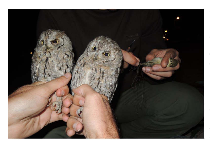
Figure 7: CABS volunteer holding two Scops Owls, while a second volunteer frees a Chiffchaff. Scops Owl is a common prey in mist nets and limesticks, where they are lured by the trapped passerines. Trappers indiscriminately kill all birds caught in mist nets. A large number of scops owls are killed every year in mist nets and limesticks. CABS volunteers freed a total of 7 scops owls among the almost 300 birds released from traps

As suggested in our previous report, in July 2013 we asked the ESBA police, which is apparently keen to cooperate with NGOS, to arrange joint night operations in the ESBA every second night from 01:00 a.m. to 09:00 a.m. during the autumn BPC for a total of 12 operations. Our plan was made considering our previous experience in autumn 2012 which showed widespread, blatant trapping with mist nets and tape lures present day and night in the ESBA territory. [46] We considered that an 8 hour night shift when tape lures easily lead to the active trapping sites would allow tackling trapping through the combination of confiscation and prosecution. This is exactly the strategy suggested by the UK Wildlife Crime Unit in a report from 2003.