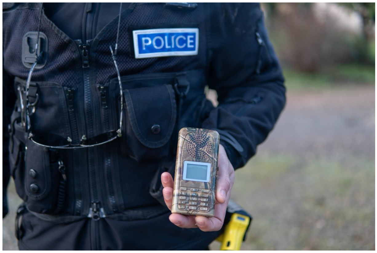
Photo 4: SBA Police officer with electronic caller seized during CABS & SPA Winter Bird Protection Camp 2021/2022 in Cyprus