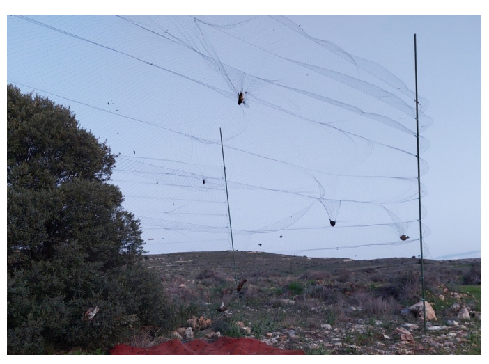
Photo 2: Trapping site with two set nets found during CABS & SPA Winter Bird Protection Camp 2021/2022 in Cyprus.