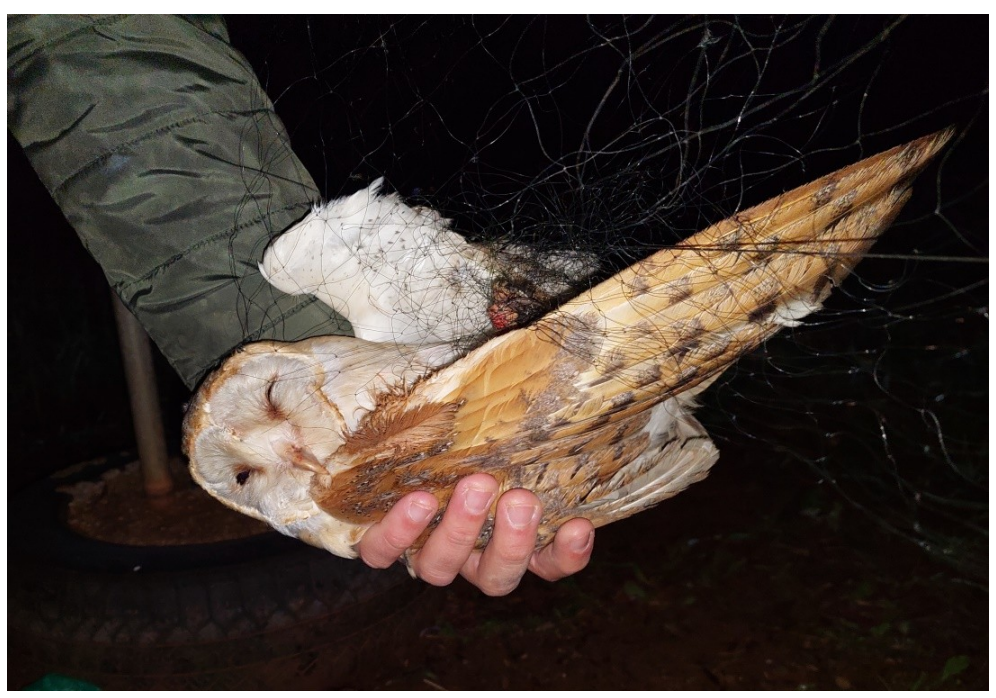
Photo 7: CABS activist with a barn owl rescued from a net found during CABS & SPA Winter Bird Protection Camp 2021/2022 in Cyprus

In recent years CABS teams have given greater attention to illegal hunting as it increasingly appears to be common and widespread. The use of illegal electronic callers in particular has long been tolerated by the authorities in the whole south-east of the island and the situation is out of control: on every hunting day it is possible to hear dozens of callers. Despite the challenges, CABS efforts and the cooperation with game wardens and SBA police continues to be successful, with increasing prosecutions every year.