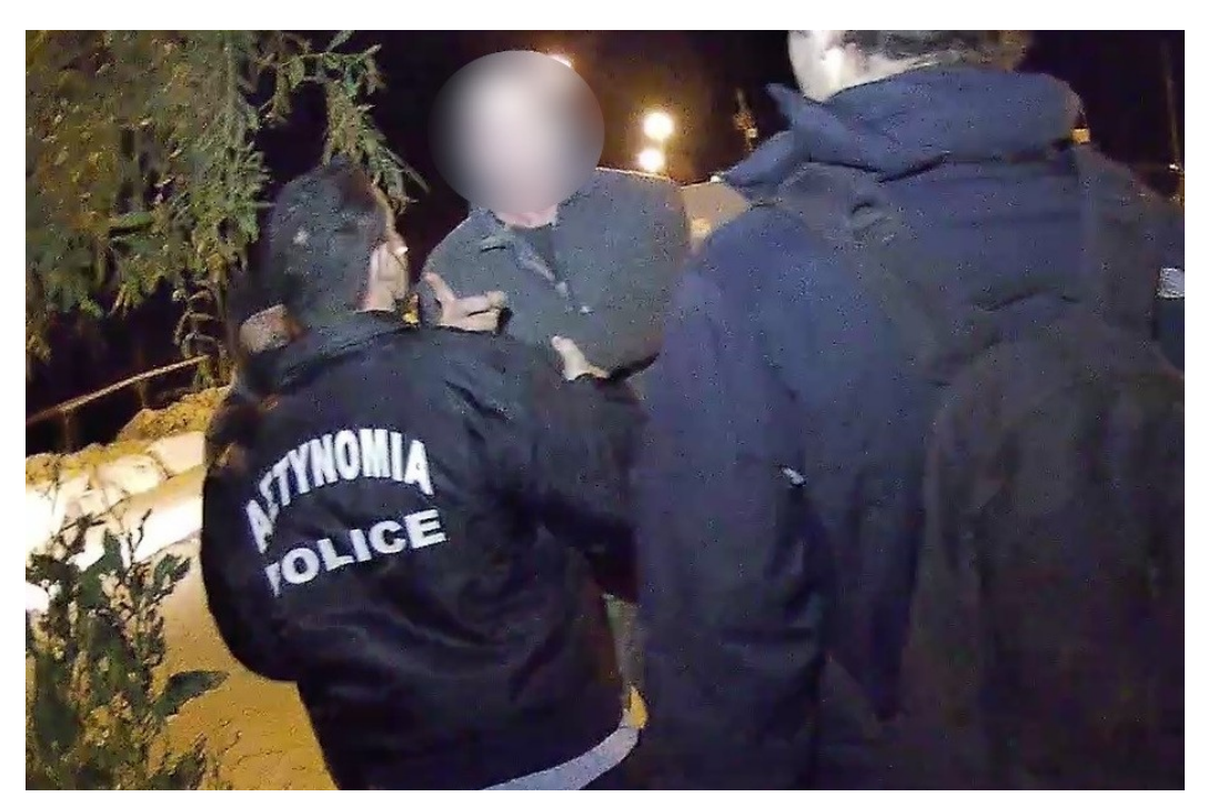
Photo 5: Notorious trapper holding and threatening police officer in Zygi on the 24<sup>th</sup> of December

02:00 - Police officer caught up with the activists and the masked trapper they were pursuing, and the officer ordered the trapper to stop. The trapper disobeyed the order and went to the nearby parking lot where a person was waiting for him. We have immediately recognized that person as the leader of the notorious trapping gang from Maroni. Gang leader grabbed the police officer and shook him violently. Then he punched one of the CABS activists and threatened the others. Then he left together with masked trapper in his car. They went to the trapping site, where the masked trapper went into the car parked by the nets and they both left, each in his own car.