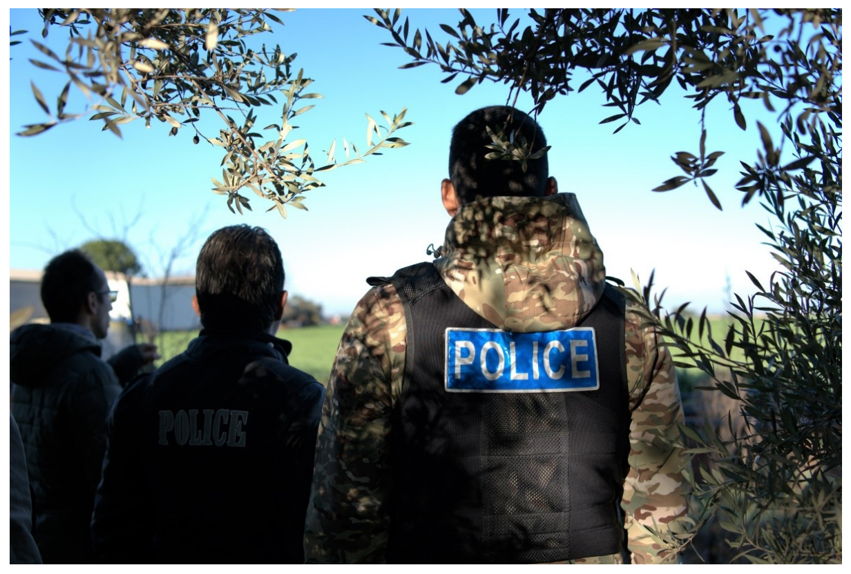
Photo 3: CABS activist showing a site with illegal hunting activity to SBA Police officers during Winter CABS & SPA Bird Protection Camp 2021/22 in Cyprus