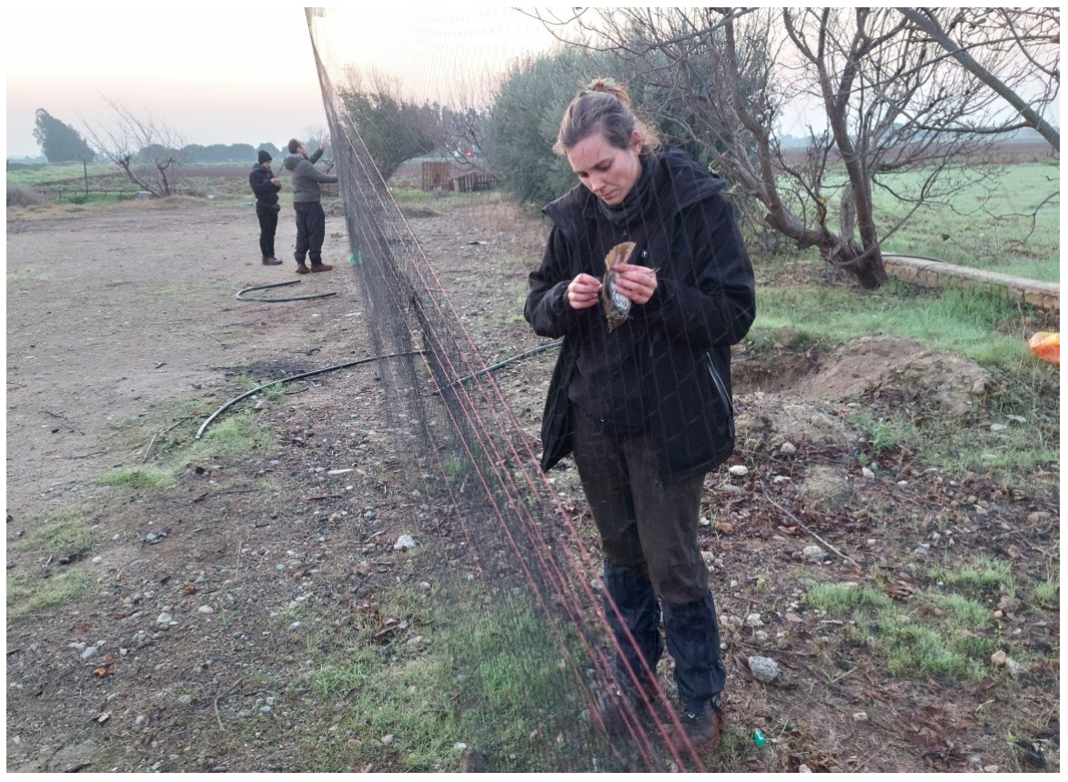
Photo 1: CABS activist freeing a song thrush caught in a net found during CABS & SPA Winter Bird Protection Camp 2021/22 in Cyprus