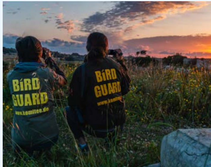
CABS team monitoring the migration across Malta.

With support from the Lebanese Internal Security Forces (ISF), our staff in Lebanon coordinated several operations to shut down several large-scale trapping facilities for the trapping of migratory songbirds. More than 70 nets and 650 limesticks were destroyed. In total, 110 birds were rescued and released from the traps – including warblers, finches and even a beautiful Palestinian Sunbird. Six bird trappers were arrested and faced prosecution.