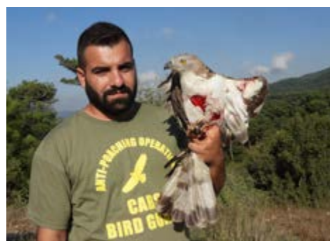
CABS collecting a shot honey buzzard in Lebanon.

In order to monitor the hunting season in Malta, several teams from CABS and BirdLife Malta were on duty on the Mediterranean island for four weeks. Thanks to round-the-clock surveillance of the main roosting areas, most birds were able to leave the island unharmed. Despite this, cases of illegal hunting were still recorded on a daily basis, including the shooting of two ospreys, a black stork, a black kite, as well as several honey buzzards and bee-eaters.