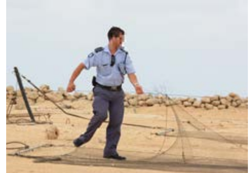
Police dismantling a clap-net in Malta.

Wader raid on Malta: Right at the beginning of the bird migration season, CABS staff discovered a huge trapping facility for the capture and shooting of plovers and other waterfowl during a search operation. The police arrested the trapper and confiscated four clap-nets, a large cage trap, a shotgun and two freshly caught ringed plovers and wood sandpipers.