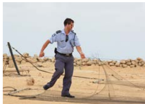
Police dismantling a clap-net in Malta.

Wader raid on Malta: Right at the beginning of the bird migration season, CABS staff discovered a huge trapping facility for the capture and shooting of plovers and other waterfowl during a search operation. The police arrested the trapper and confiscated four clap-nets, a large cage trap, a shotgun and two freshly caught ringed plovers and wood sandpipers.