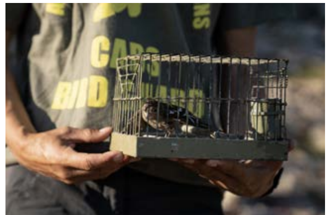
CABS with live finch decoy in Malta.

Illegal songbird trapping in Malta: Within three weeks, our teams caught 16 people catching or shooting protected migratory birds during operations with the Maltese Environmental Police (EPU). A total of 105 live decoys, 37 nets, 12 electronic decoys and two shotguns were seized. The birds – mainly greenfinches, linnets, hawfinches, siskins and some robins – were later released into a nature reserve with support from BirdLife Malta.