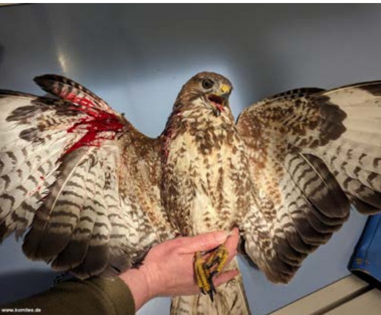
A buzzard found with gunshot injuries in Northrhine-Westphalia.

Illegal raptor persecution in Germany: In the first four months of the year, our wildlife crime and registration and documentation centre 'EDGAR' recorded more than 20 confirmed cases, including the shooting of a white-tailed eagle in the district of Coesfeld (North Rhine-Westphalia), a white-tailed eagle killed with carbofuran near Peine (Lower Saxony), poisoned buzzards and red kites in Bavaria, a shot eagle owl in Kelheim (Rhineland-Palatinate), the trapping and maiming of a bird of prey with a leghold trap in Münster as well as the illegal sale of a sparrowhawk on the internet.