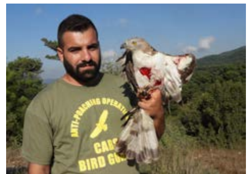
CABS collecting a shot honey buzzard in Lebanon.

In Lebanon, CABS together with our partner associations from the Society for Protection of Nature in Lebanon (SPNL) and our joint Anti-Poaching Unit (APU), were very busy fighting against the illegal shooting of lesser spotted eagles, honey buzzards and other birds of prey. For the first time, mass slaughter sites were documented in the border area with Syria. In the districts of Keserwan, Akkar and northern Lebanon, the Internal Security Forces (ISF) arrested a total of 37 poachers during our actions. Their weapons, including two machine guns, were confiscated, as well as ten nets and 317 limesticks used to trap songbirds.