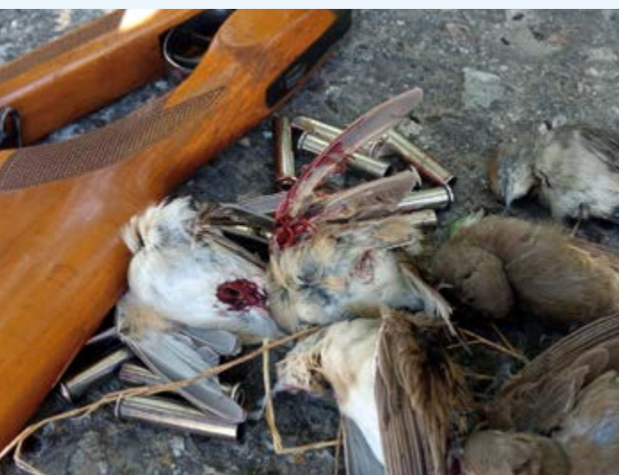
Shot warblers in Reggio Calabria.

Action in southern Italy: Around the coastal city of Reggio Calabria, CABS teams collected evidence against the late summer hunting of garden warblers that is widespread in the region. The animals are considered a delicacy because of their food on the draught – sweet fruits such as figs and ripe plums. The carabinieri (police) were able to convict a total of four hunters following tip-offs from our teams. During subsequent searches, 24 freshly shot garden warblers and 18 unregistered hunting weapons were also found and seized.