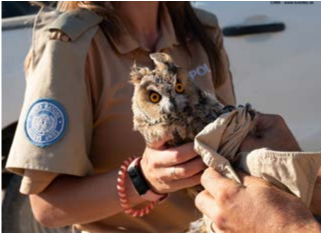
Long-eared owl saved from limesticks in Cyprus.

In Cyprus, our teams, with the support of the Pro Biodiversity Foundation (SPA), spend a very busy eight weeks searching for illegal trapping sites for songbirds. With the help of the police and wardens from the Game and Fauna Service (GFS), we were able to dismantle a total of 1,476 limesticks, 57 nets and 80 electronic decoys across 78 active trapping sites. 761 birds, including warblers, nightingales, orioles and many other species, were rescued and released from the traps. Fines are being initiated against 43 people for violations of the Hunting Act.