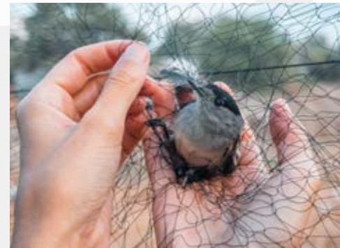
A male blackcap rescued from an illegal trapping net in Cyprus.

The same applies, of course, to our work along the central and western migratory flyways where we have carried out actions against bird trapping and illegal hunting in Spain, Italy, France, Malta and Cyprus. The operations were particularly effective in Cyprus, where our teams, with the support of game wardens and police, were able to dismantle >1,500 limesticks and rescue 761 freshly caught birds this autumn. At the same time, we observed a massive decrease in illegal bird trapping on the island in winter and spring. Just five years ago, our teams found more than 40 active trapping sites with 137 nets between January and February.