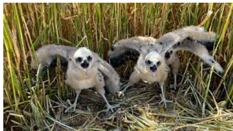
Marsh harrier chicks found in the grain fields.

Saved from the combine harvesters: In the Zülpicher Börde (North Rhine-Westphalia), CABS staff were busy using drones to search for nests of harriers in the grain fields. Four broods of the marsh harrier and four nests of montagu’s harriers were discovered, around which protection zones were established which the farmers agreed to refrain from harvesting. The farmers are compensated by the responsible districts for the loss of harvest. A total of four young marsh harriers and 12 marsh harriers fledged from the nests we protected!