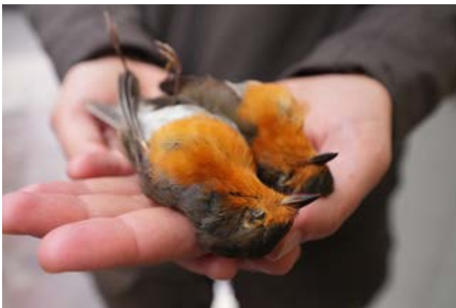
Too late to help these robins in Brescia, Italy.

Large-scale operation in northern Italy: At our large bird protection camp in the province of Brescia, 38 volunteers from six countries were busy working for four weeks against illegal bird poaching. Together with a special unit of the carabinieri (police), 48 poachers will be summoned to court, including 30 bird trappers and 18 hunters caught with protected species. The police confiscated several rifles, 52 trapping nets, 230 bow traps and 378 snap traps. The penalty range is between 1,000 and 5,000 euros depending on the scope of the offences.