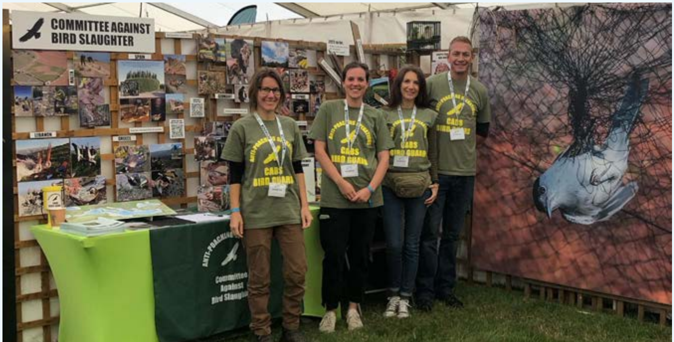
The CABS stand at the Global BirdFair, Rutland, UK.

hunting in Cyprus and Lebanon. With several thousand visitors and hundreds of exhibitors from numerous sectors within conservation and birdwatching, the event is by far the largest bird protection trade fair in the world.