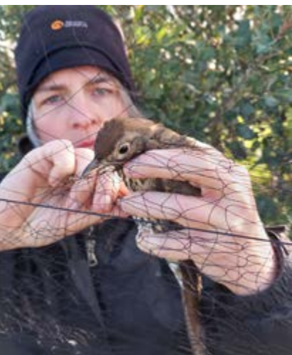
CABS activist saving a song thrush from trapping net in Cyprus.

During a house search in the district of Schaumburg (Lower Saxony), the police seized around 50 live bluethroats, redstarts and other songbirds as well as equipment for bird trapping from an alleged breeder. In addition, numerous frozen and stuffed birds and two weapons were confiscated. The case followed a report from CABS, after we collected extensive evidence of illegal trapping and trafficking by the accused and handed it over to the public prosecutor's office.