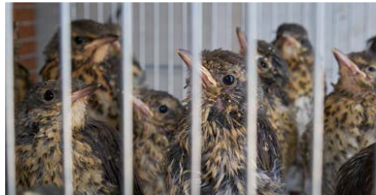
Song thrush chicks used as live decoys for hunting in Italy.

An animal abuser from Emsland (Lower Saxony) was sentenced to a fine of 3,500 euros by the district court of Lingen for catching and killing a strictly protected goshawk. In addition, the man's hunting license was also confiscated. The proceedings were initiated following a CABS report, whose staff caught the farmer red-handed with a camera in December 2022 and called in the police.