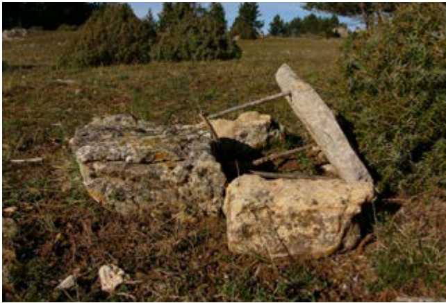
Stone-crush trap in Cevennes, France.

Bird trapping like in the Stone Age: Despite the threat of proceedings before the European Court of Justice, France once again allowed the capture and killing of wintering thrushes with stone crush traps (tendelles) in central France. In January, a small CABS team spent two weeks in the two departments of Aveyron and Lozère documenting the scale of the brutal and cruel hunt. The resulting material served as the basis for legal action against France for infringement of the Birds Directive.