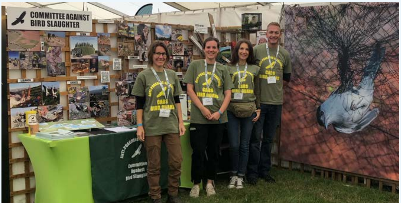
The CABS stand at the Global BirdFair, Rutland, UK.

hunting in Cyprus and Lebanon. With several thousand visitors and hundreds of exhibitors from numerous sectors within conservation and birdwatching, the event is by far the largest bird protection trade fair in the world.