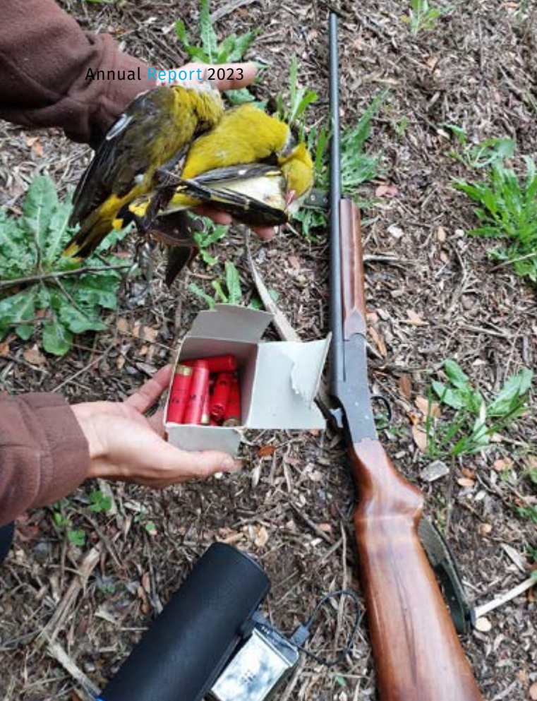
Golden orioles shot dead during spring migration in Zakynthos.

Detecting, combating and preventing: CABS presented a new, 44-page guideline document on how to deal with illegal persecution of birds of prey in Germany. The brochure, which was produced with the support of the German Federal Agency for Nature Conservation (BfN) and the German Federal Ministry for the Environment (BMUV), is aimed specifically at employees of public authorities and anyone who witnesses this form of wildlife crime. Printed copies can be requested from us free of charge.