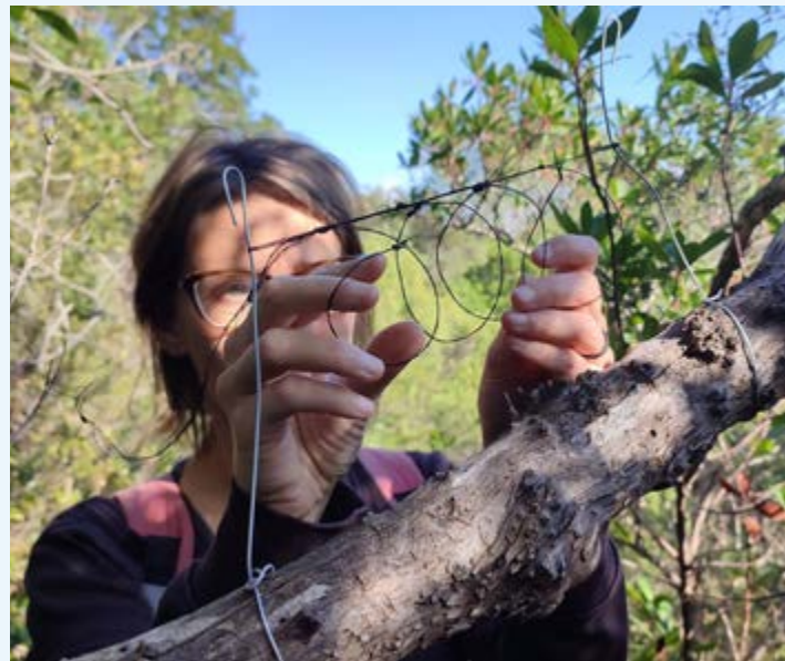
Dismantling 'horsehair snares' in Sardinia.

Snare traps in Sardinia: The hills of the Mediterranean island are an important wintering area for thrushes and other migratory birds. Unfortunately, every year countless animals die in a horrible death caught in horsehair snares set up by poachers. During a two-week search operation, a CABS team around the capital Cagliari was able to track down 480 of these snares and large net trapping site and dismantle them together with the authorities. Two bird trappers were convicted on the basis of our case materials and 49 dead birds were seized.