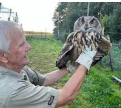
Shot eagle owl found in Bonn/Germany.

EU law, CABS teams were active on the ground between October and November. Together with the police, we managed to shut down 26 trapping sites due to various violations. In the process, 217 live birds and a truckload of trapping equipment was confiscated. 19 bird trappers were caught red-handed or later identified from our video evidence.