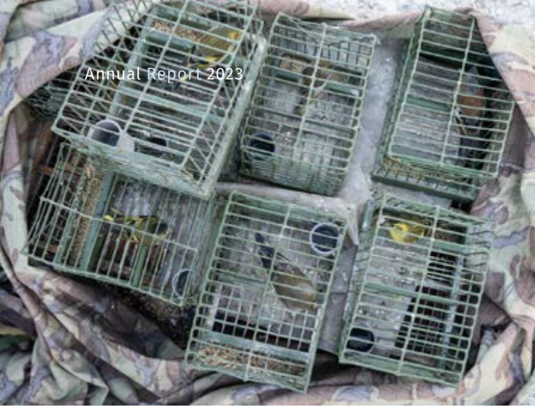
Live finch decoys seized from trapping sites in Malta.

EU law, CABS teams were active on the ground between October and November. Together with the police, we managed to shut down 26 trapping sites due to various violations. In the process, 217 live birds and a truckload of trapping equipment was confiscated. 19 bird trappers were caught red-handed or later identified from our video evidence.