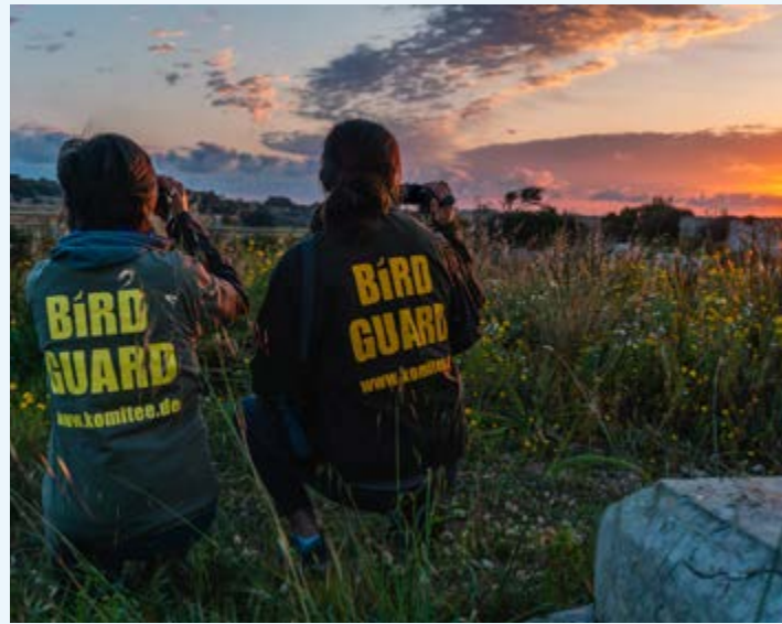
CABS team monitoring the migration across Malta.

With support from the Lebanese Internal Security Forces (ISF), our staff in Lebanon coordinated several operations to shut down several large-scale trapping facilities for the trapping of migratory songbirds. More than 70 nets and 650 limesticks were destroyed. In total, 110 birds were rescued and released from the traps – including warblers, finches and even a beautiful Palestinian Sunbird. Six bird trappers were arrested and faced prosecution.