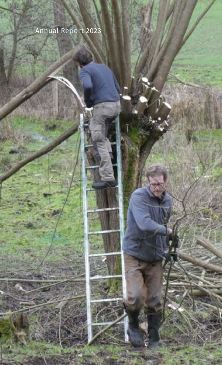
Pollarding trees in Schwentinental wetland reserves.

Bird protection with a chainsaw: In the winter months, extensive maintenance measures take place in our protected area 'Schwentinental wetland reserves' in northern Germany (Schleswig-Holstein). An old hedge was cut back over a length of 700 metres and a total of 12 old pollarded willows were 'trimmed' on a wet meadow in the west of our land. All work is carried out together with our friends from the Schwentinental Nature Conservation Group.