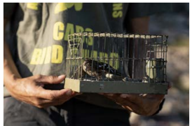
CABS with live finch decoy in Malta.

Illegal songbird trapping in Malta: Within three weeks, our teams caught 16 people catching or shooting protected migratory birds during operations with the Maltese Environmental Police (EPU). A total of 105 live decoys, 37 nets, 12 electronic decoys and two shotguns were seized. The birds – mainly greenfinches, linnets, hawfinches, siskins and some robins – were later released into a nature reserve with support from BirdLife Malta.