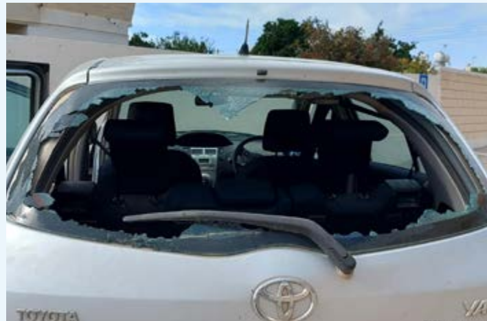
Vehicle damaged by poachers in Cyprus.

Violence against bird conservationists: Within just a few days, there is a series of serious attacks against our teams in Cyprus. Three members were slightly injured, two vehicles were damaged, and several cameras and mobile phones were destroyed or stolen. The perpetrators are poachers who, spurred on by a campaign by the hunting lobby, do not want to be filmed in their illegal activities. The police are investigating assault, coercion and damage to property.