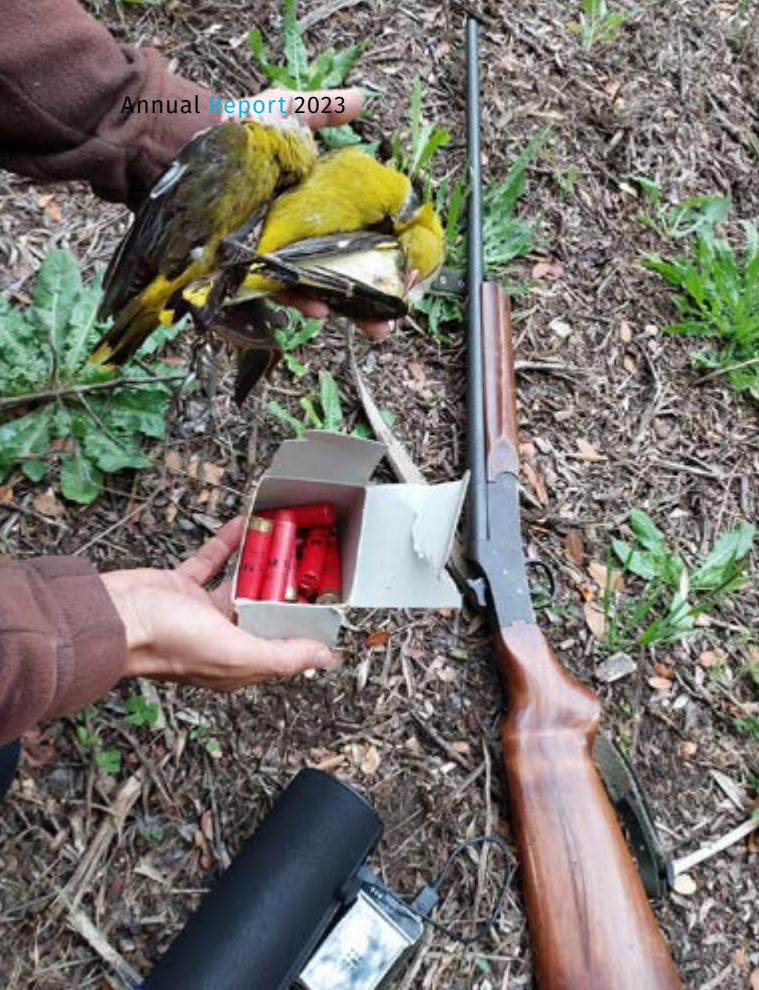
Golden orioles shot dead during spring migration in Zakynthos.

Detecting, combating and preventing: CABS presented a new, 44-page guideline document on how to deal with illegal persecution of birds of prey in Germany. The brochure, which was produced with the support of the German Federal Agency for Nature Conservation (BfN) and the German Federal Ministry for the Environment (BMUV), is aimed specifically at employees of public authorities and anyone who witnesses this form of wildlife crime. Printed copies can be requested from us free of charge.