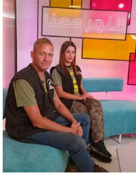
CABS staff discussing anti-poaching work in Lebanese TV.

In the lagoons around the Delta of the Po River (Italy), CABS teams are using drones and rubber dinghies to document the illegal hunting of wintering waterfowl. In addition to the shooting of protected geese and ducks, the extensive use of electronic decoys by hunters is documented. Criminal proceedings are being initiated against at least two hunters.