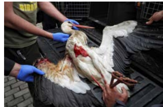
White stork with severe gunshot injuries in Lebanon.

In Lebanon, an international team from CABS and our Lebanese partners from the Society for the Protection of Nature in Lebanon (SPNL) took action against the illegal shooting of white storks. In the mountains east of the city of Tripoli, a total of 18 stork shootings were documented within a week. In cooperation with the police and the military, five poachers were arrested. In the coastal town of Arida, along the border with Syria, several storks kept as live decoys are discovered and freed during a raid with the Internal Security Forces (ISF).