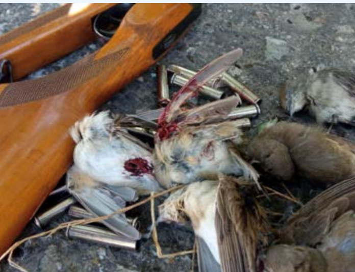
Shot warblers in Reggio Calabria.

Action in southern Italy: Around the coastal city of Reggio Calabria, CABS teams collected evidence against the late summer hunting of garden warblers that is widespread in the region. The animals are considered a delicacy because of their food on the draught – sweet fruits such as figs and ripe plums. The carabinieri (police) were able to convict a total of four hunters following tip-offs from our teams. During subsequent searches, 24 freshly shot garden warblers and 18 unregistered hunting weapons were also found and seized.