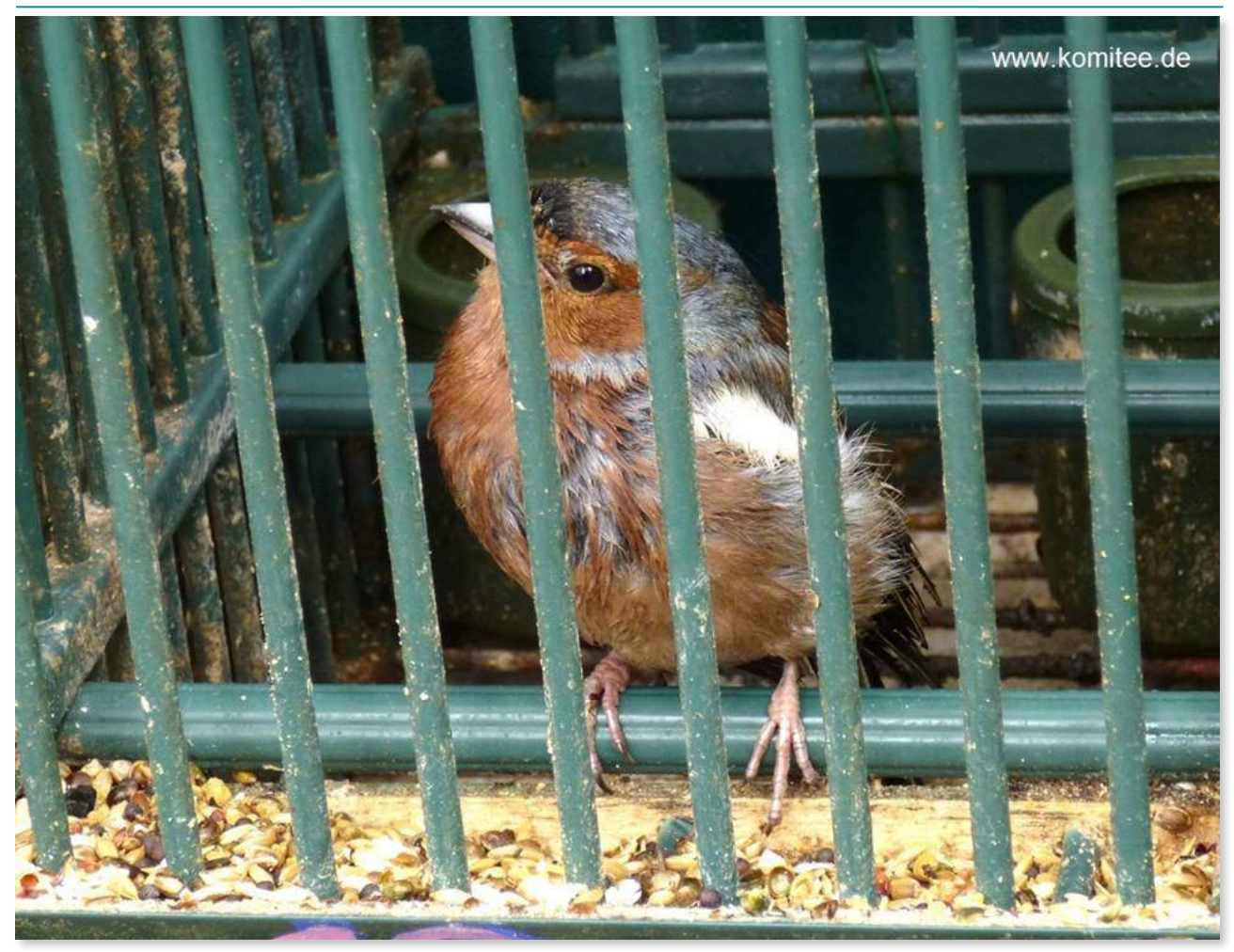
After year of campaigning and complaints the European Court of Justice forces the Maltese government to ban finch trapping or face sanctions.

• Finch trapping on Malta violates EU law: The European Court of Justice finally condemns Malta for allowing finch trapping with clap nets. For years, Malta had overruled EU law and approved thousands of trapping licenses every year. CABS and our colleagues at BirdLife Malta sharply criticized this practice and documented the impact of mass trapping for the European Commission. The final verdict marks one of the biggest achievements in European migratory bird protection in recent years.