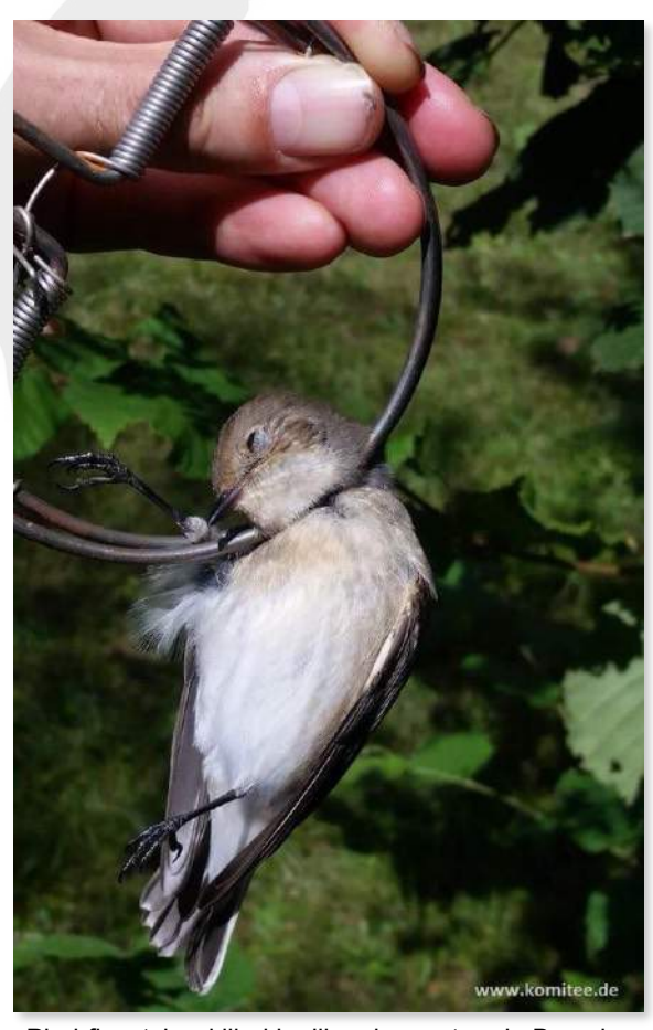
Pied-flycatcher killed by illegal snap trap in Brescia, Italy.