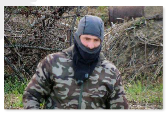
Masked poacher on Ischia

Bird protection camp on Ischia: As part of our annual campaign against the illegal spring hunting on the Mediterranean island, five illegal trapping sites with a total of 52 snap traps for passing Whinchat and Wheatear are deactivated. In addition, our teams discover two shotguns hidden by poachers and 300 rounds of ammunition that were subsequently confiscated by the police. A masked poacher is later convicted and charged. Bird trapping on Ischia has significantly declined over the past 20 years as a direct result of our field operations.