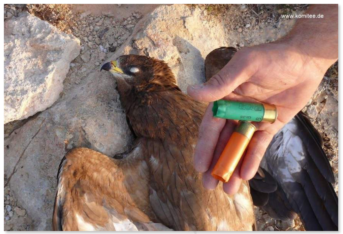
Freshly shot Honey Buzzard in Calabria, Italy.

In Calabria and Sicily, our teams working against bird of prey slaughter catch three poachers shooting Honey Buzzards. Following a CABS report, two more freshly shot buzzards and several mammal snares were found and seized during house searches and confiscated as evidence. The suspects are awaiting trial.