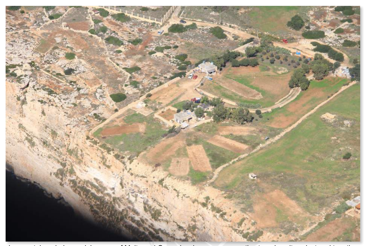
Images taken during aerial survey of Malta and Gozo showing numerous active trapping sites clustered together.

Police operation against bird trapper in North Rhine-Westphalia: A CABS team discovered two illegal 'ladder traps' for birds of prey and crows whist investigating a hunting area in Espelkamp (Minden-Lübbecke). The traps were baited with food and plastic crows. The police were called to seize both traps and initiate criminal proceedings.