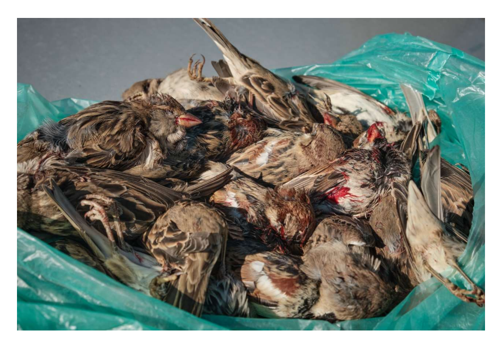
Picture 2: Bag with 24 shot Spanish sparrow was found in possession of a hunter reported by CABS activists in October 2021

In the Republic of Cyprus the Game and Fauna Service is the only institution specifically designated to deal with the problem of poaching since 2019, when the Anti-Poaching Unite of the police was dismantled. For this reason CABS report the cases of wildlife crimes to game wardens whenever possible.