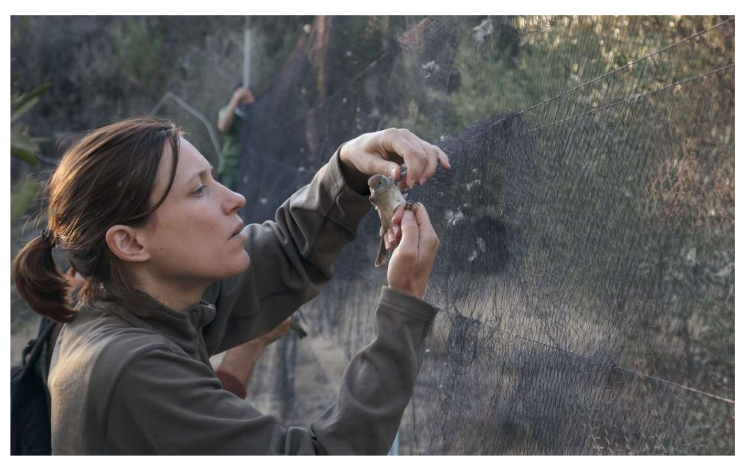
Picture 1: CABS activist rescuing bird from a net found in Kalavasos, October 2021

Every autumn since 2009, CABS & SPA organize bird protection camp in Cyprus to prevent massive slaughter of birds migrating over Cyprus. This autumn the camp started on the 6th of September and ended on the 14th of November, running for a total of 70 days and covering most of the autumn poaching season. 14 bird protection activists from 7 different countries (Germany, Great Britain, Italy, Switzerland, Slovenia, Spain and United States of America) participated at the camp. 10 volunteers already participated to previous camps in Cyprus, while 4 of them were first timers. The volunteers monitored the eastern and the southern part of Cyprus: Famagusta and Larnaca District within the Republic of Cyprus, the British Eastern Sovereign Base Areas and part of the self-proclaimed Turkish Republic of Northern Cyprus.