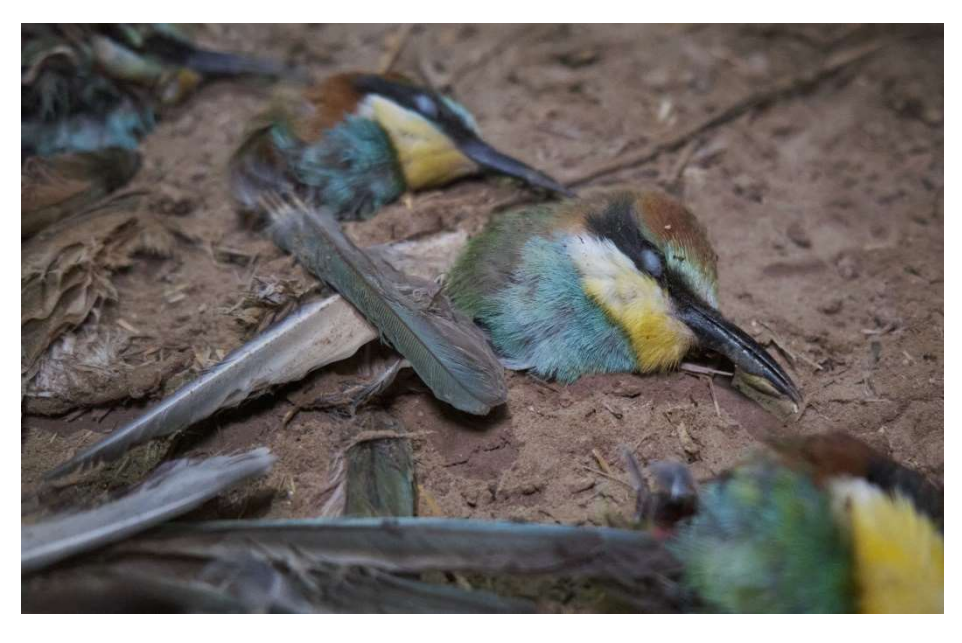
Picture 4: Heads of Bee-eaters, found at the hunting site near Lake Soros, September 2021

As shown in Section 8 of this report CABS volunteers have now clearly become the main stakeholder in the field against illegal bird killing activities and this unpleasant role has made CABS the main target for criminal individuals and gangs. In 2021 our teams suffered the highest level of intimidation and violence with two dangerous and serious aggressions – even a pyrotechnic bomb placed on our car - happening in autumn and winter. Although the relevant Ministries have been always and immediately informed of these events, we have never received a reply from anyone. Instead we see that the Parliament is discussing a law proposal which should punish people who "disturb" legal hunting activity. Since there are no such people in Cyprus, it is clear that the aim is to prevent CABS from exposing and pushing to sanction the illegal killing of birds that take place in the Republic of Cyprus.