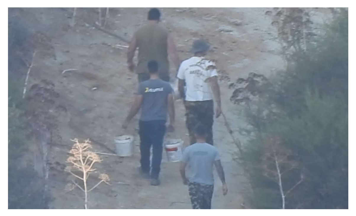
Picture 3: Trappers with buckets full of killed birds, collected from nets at the trapping site of Akas, September 2021