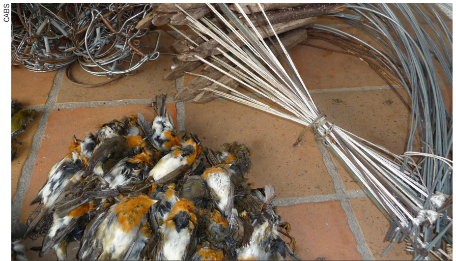
Bow traps – pictured on the right – are among the most brutal animal traps in the world. CABS has collected many of them over the years, especially in Italy.

delicacies, but also Golden Orioles, cuckoos, owls and other protected species are caught indiscriminately and killed.