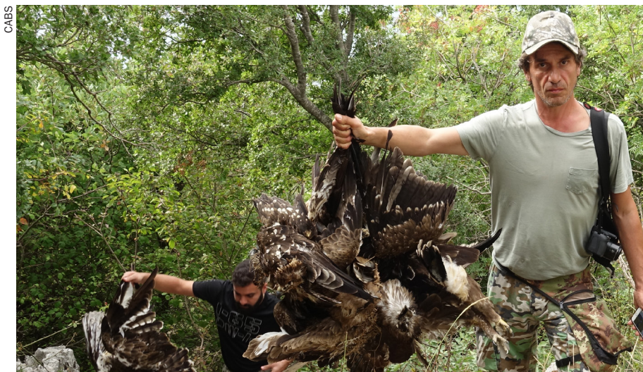
Migrating raptors are a popular target among hunters. In this photo, CABS volunteers salvage the bodies of dead European Honey Buzzards in Lebanon.

Where the support of authorities is lacking, CABS takes action itself. For example, each year in Cyprus and Italy it dismantles or destroys thousands of items of illegal hunting equipment, frees hundreds of protected birds and documents its findings for press