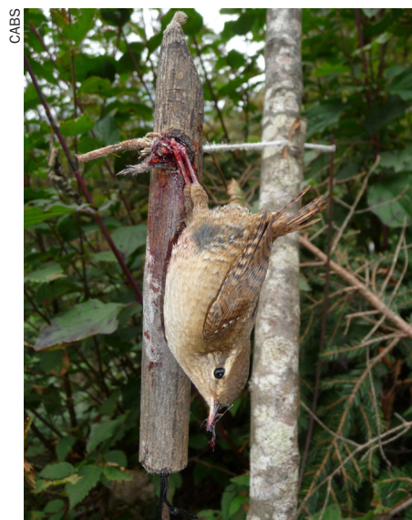
This Eurasian Wren was found in northern Italy, where rampant trapping of passerines migrating through the subalpine mountains of Brescia is a major issue.

The CABS bird-protection camp in Brescia has grown to become one of its