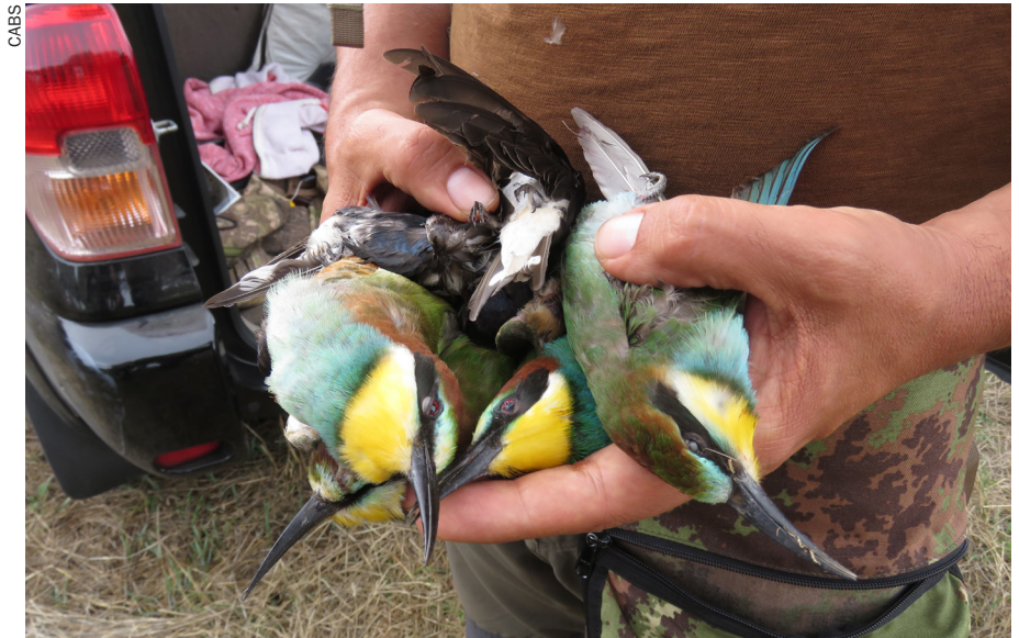
Some colourful species, such as European Bee-eater, are shot for private taxidermy collections. Birds can be killed en masse as they migrate north in spring and back south again in autumn.

Further east is Cyprus – an island which is essentially the 'problem child' of bird protection in the EU. The south of the island – which has been part of the EU since 2004 – is a black hole for migratory birds crossing the eastern Mediterranean. Particularly in the south-east, olive gardens, bushes and acacia groves are specially prepared for poaching. Hundreds of bird trappers set out 'limesticks' – carefully prepared canes covered in glue – and industrial-scale trapping sites with large mistnets, where thousands of birds are caught each night. It is estimated that around 2 million to 3 million migratory birds are illegally killed in Cyprus each year. Warblers and thrushes are the primary targets, to be offered as expensive