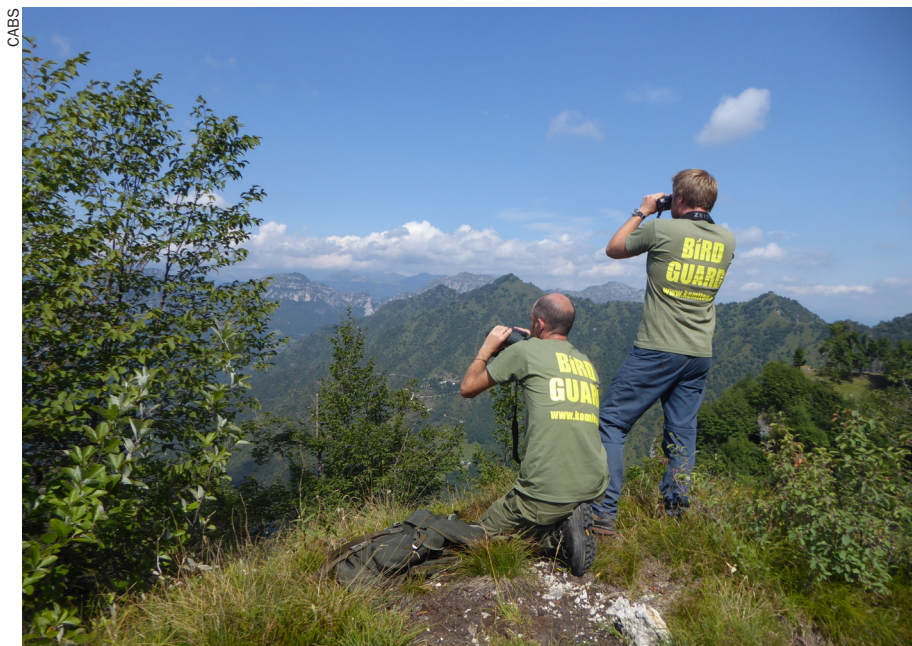
CABS relies on volunteers to get in the field and seek out illegal hunters and traps. It is a time-consuming, arduous and sometimes dangerous task.

CABS is now growing faster than ever. With more volunteers and resources, the experience gained from many recent campaigns and the growing reputation of its successes will enable it to embark on projects on new shores. The progress made in Malta, Italy, Cyprus and Lebanon required years of work, significant financial resources and a lot of dedicated passion and willpower. Looking back over the past 40 years shows how some successes were only achieved after decades of dedicated work. A good example is the end of legal bird trapping in Italy, which was fought for since 1975 and only became